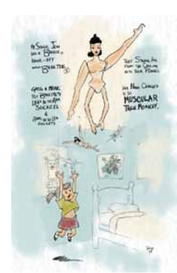
Muscular Tree Monkey 2010