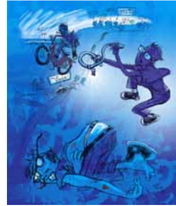
The Nellie 2010