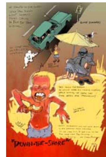
Down The Shore 2010

DAD HATED THE BEACH . HE WOULD WEAR HIS CHURCH CLOTHES WHILE SITTING UP NEAR THE DUNE GRASS AND PARKING LOT